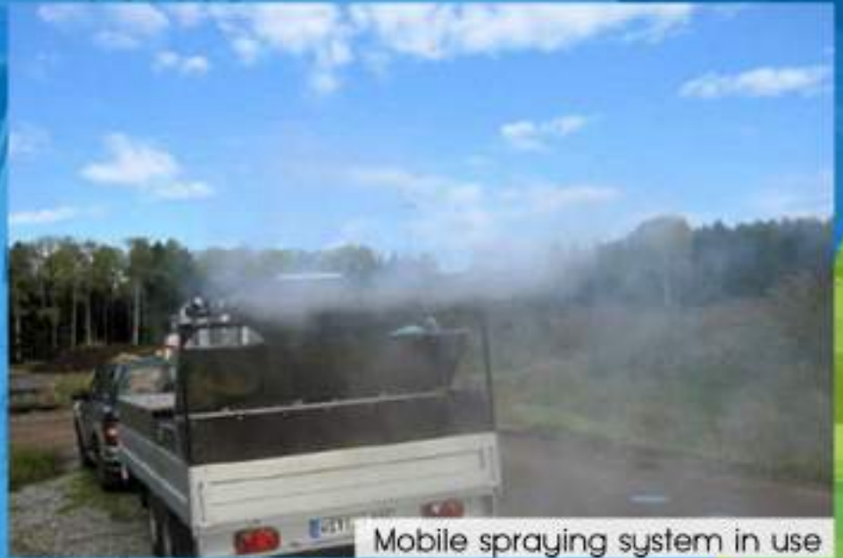
Mobile spraying system in use