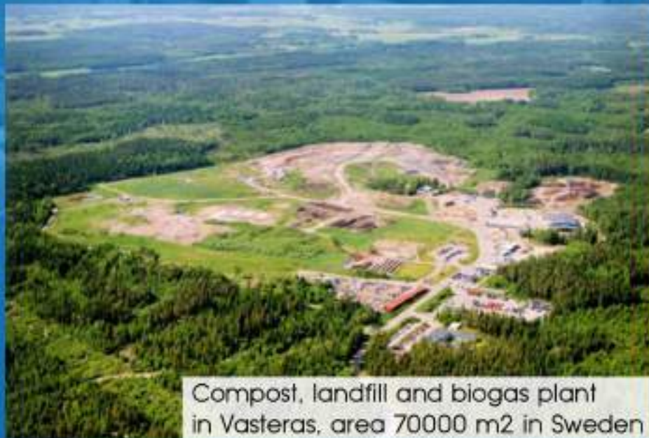
Compost, landfill and biogas plant in Vasteras, area 70000 m2 in Sweden