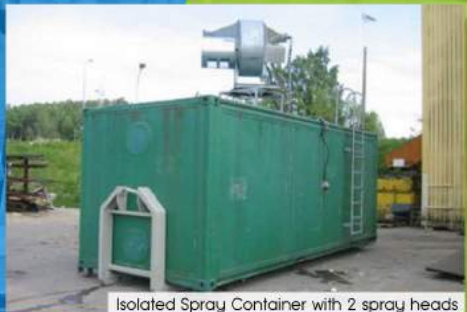
Isolated Spray Container with 2 spray heads