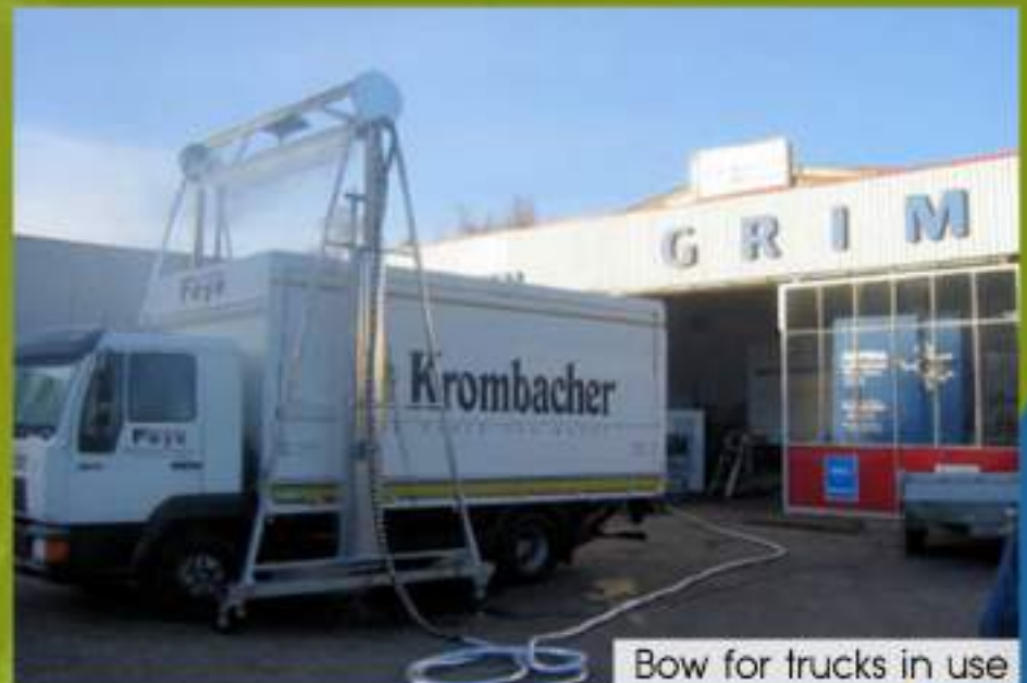
Bow for trucks in use