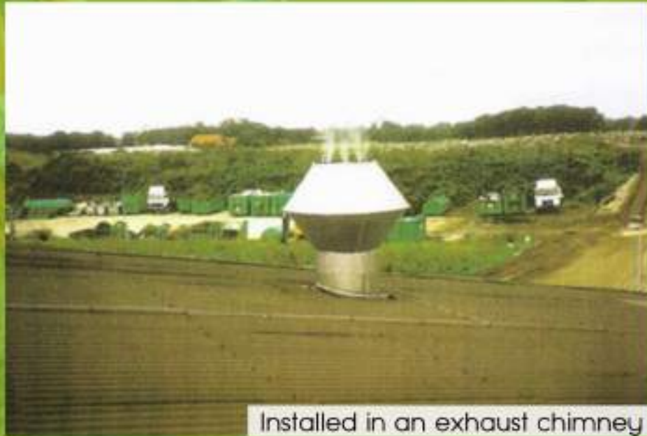
Installed in an exhaust chimney