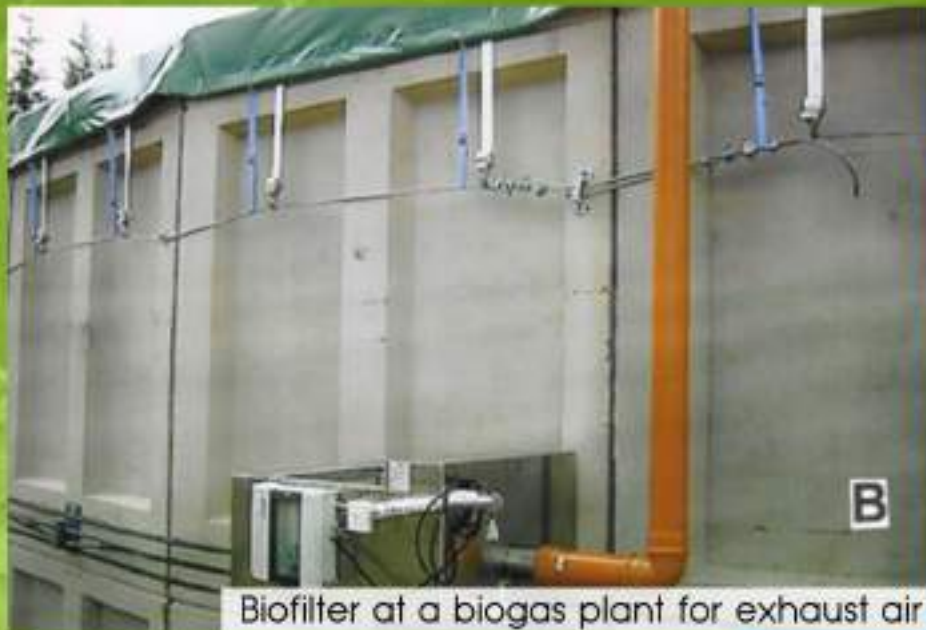
Biofilter at a biogas plant for exhaust air