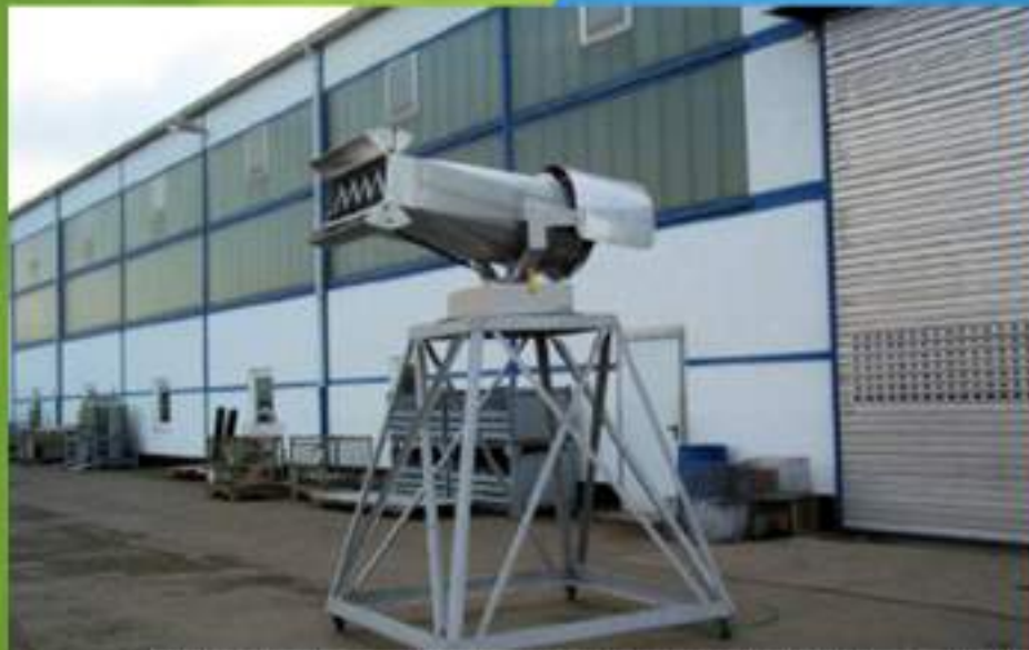
Separate spray head made of stainless steel