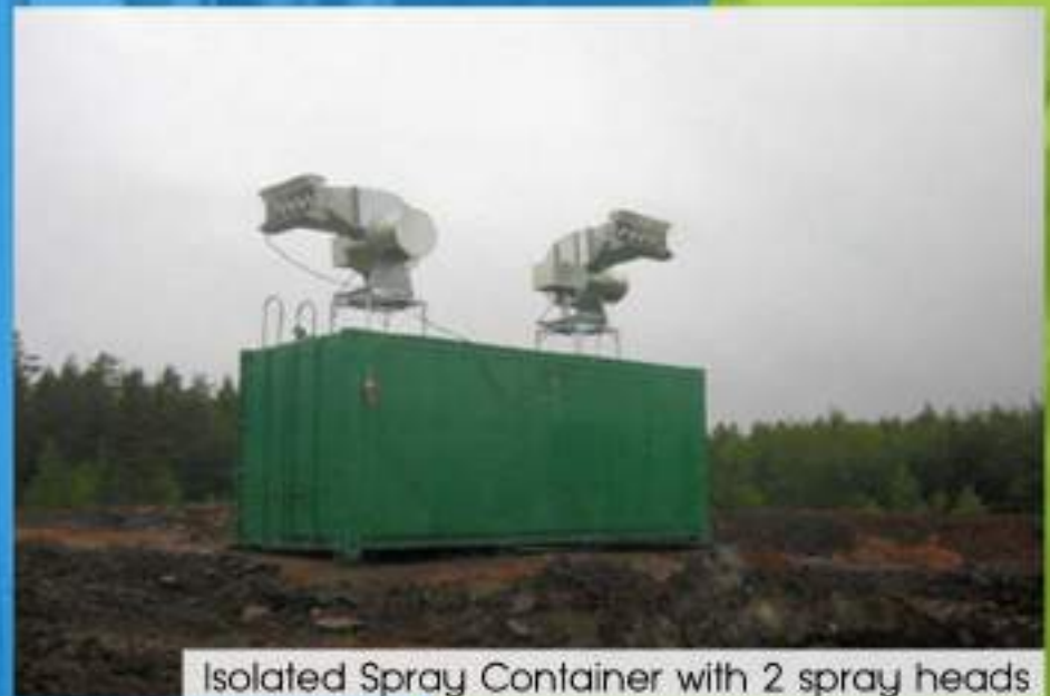
Isolated Spray Container with 2 spray heads