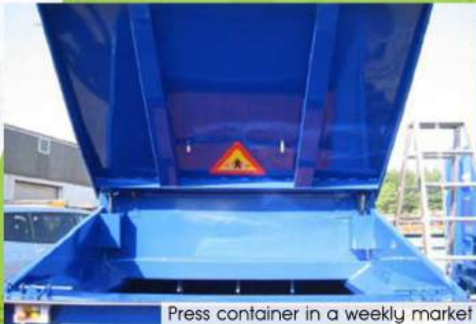
Press container in a weekly market