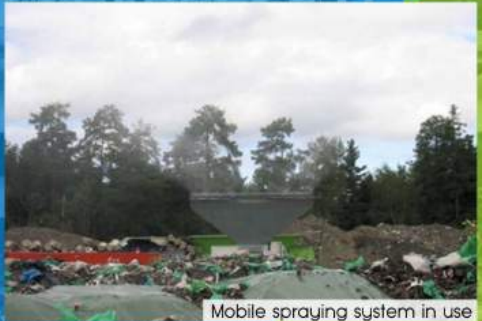
Mobile spraying system in use