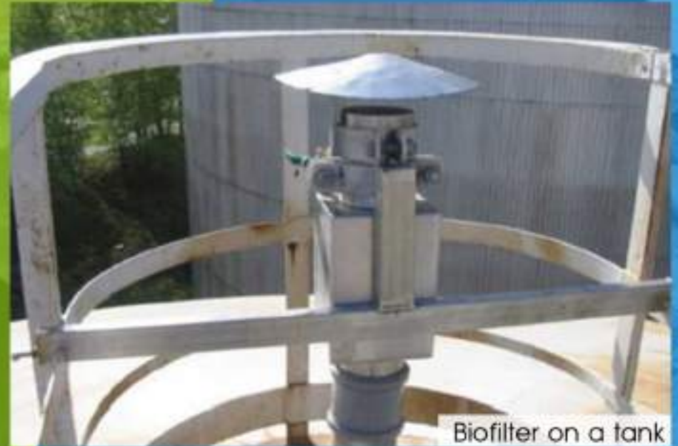
Biofilter on a tank