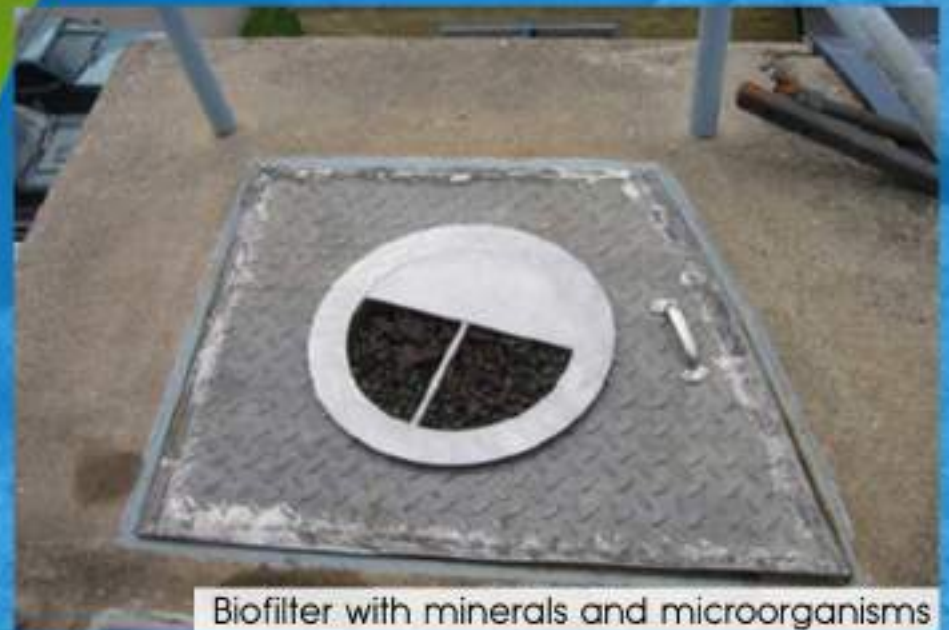
Biofilter with minerals and microorganisms