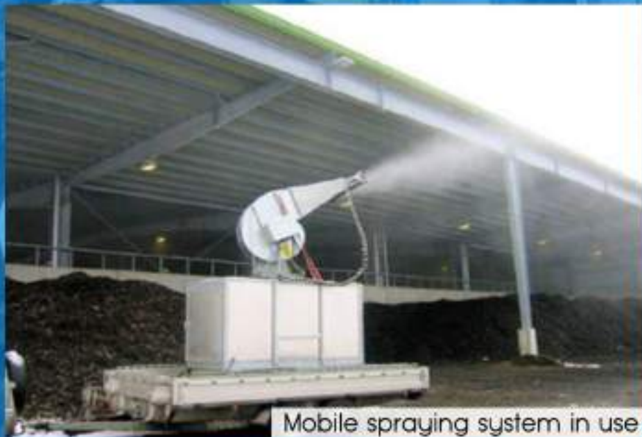
Mobile spraying system in use