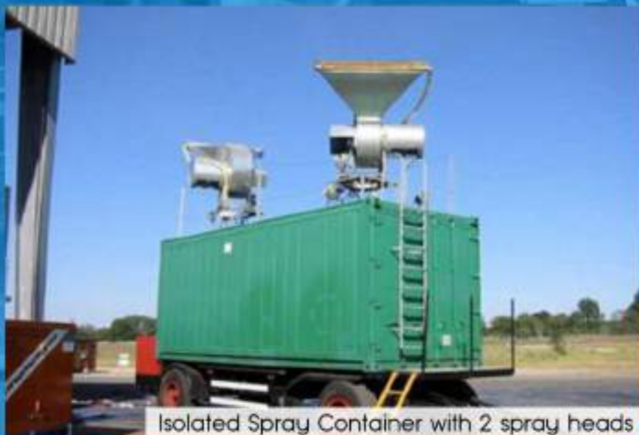
Isolated Spray Container with 2 spray heads