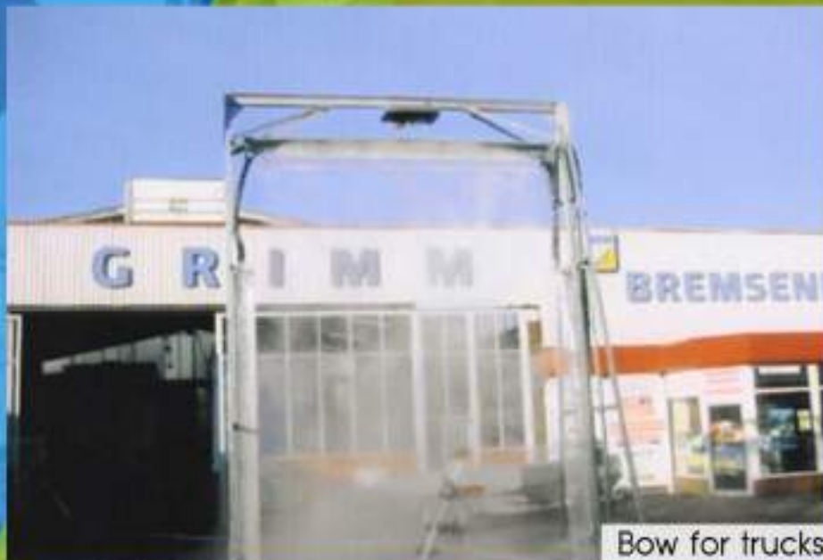
Bow for trucks