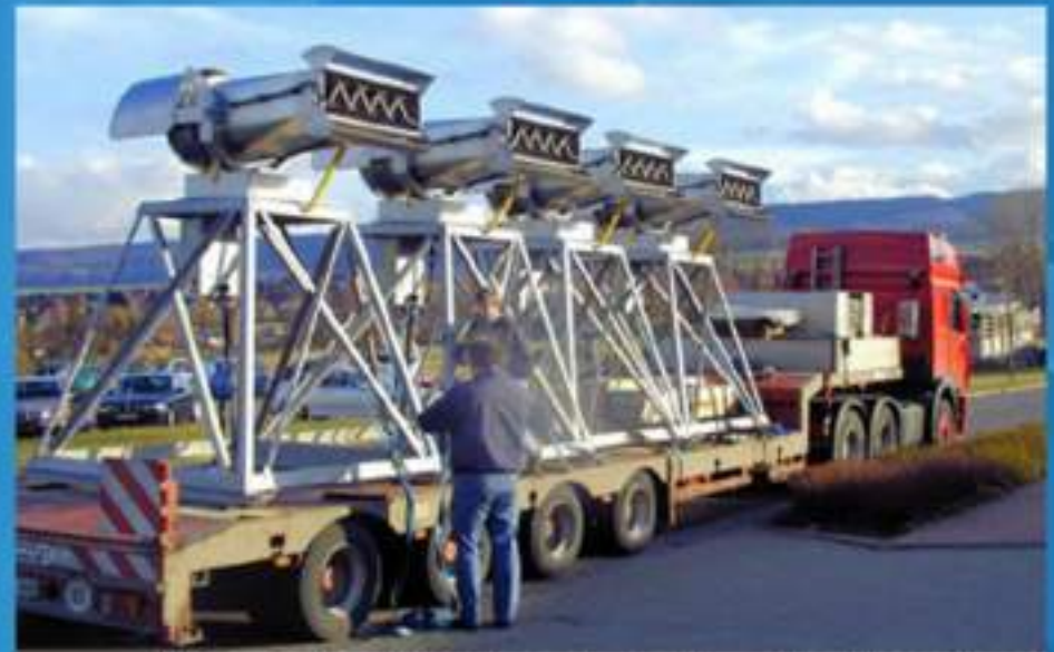
Separate spray head made of stainless steel