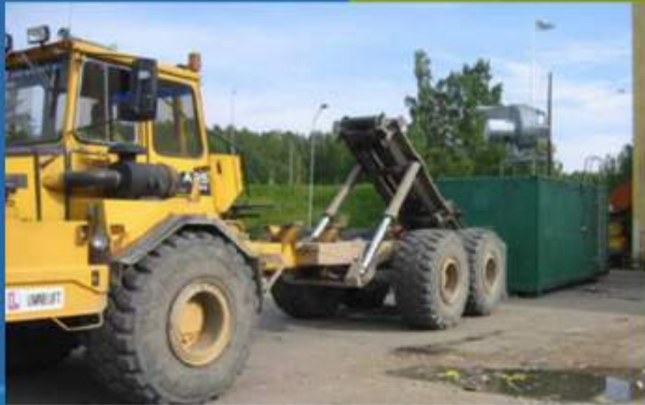
Isolated spray container with trailing barge in function