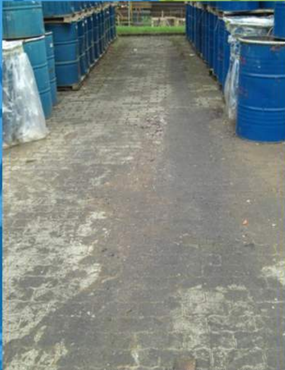
10 years old exterior industrial floor. Cleaned every day with chemical cleaning products.