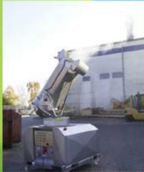
Fully automatic spraying system 360 degrees rotating-stainless steel