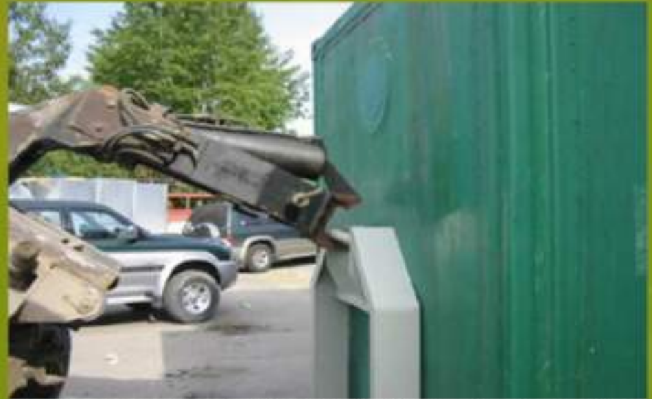
Isolated spray container with trailing barge in function