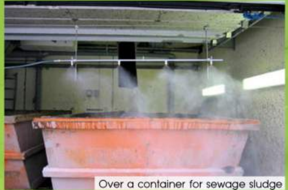
Over a container for sewage sludge