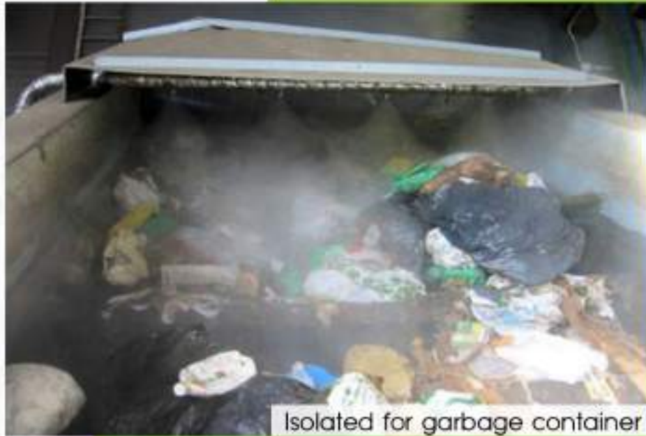
Isolated for garbage container