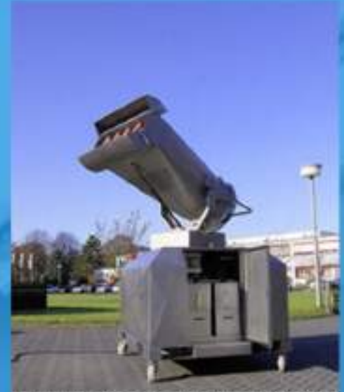
Fully automatic spraying system 360 degrees rotating-stainless steel