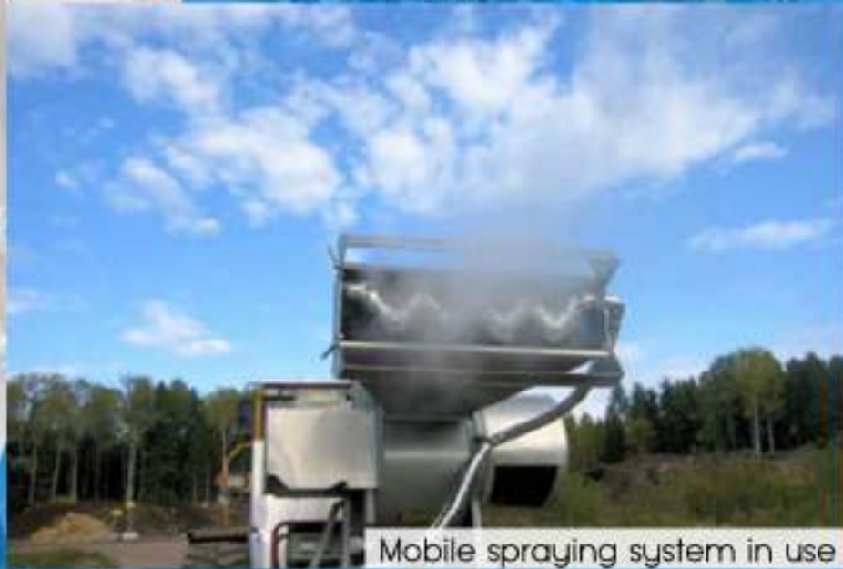
Mobile spraying system in use